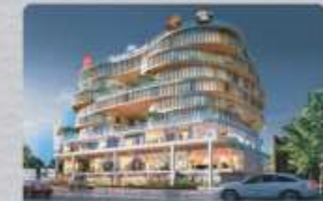
The Capital Avenue